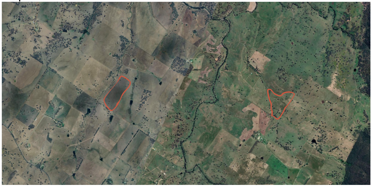
Google Maps 1 image reference