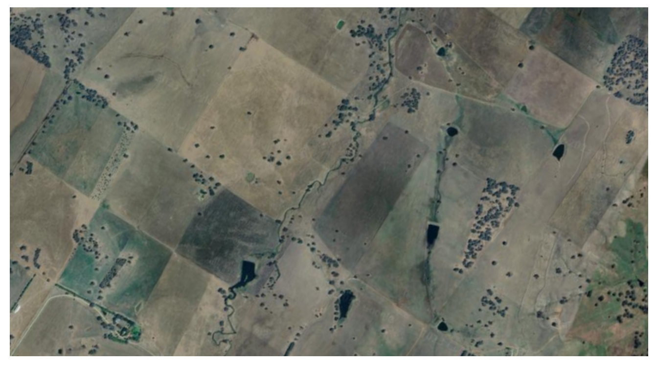
Google Maps 3