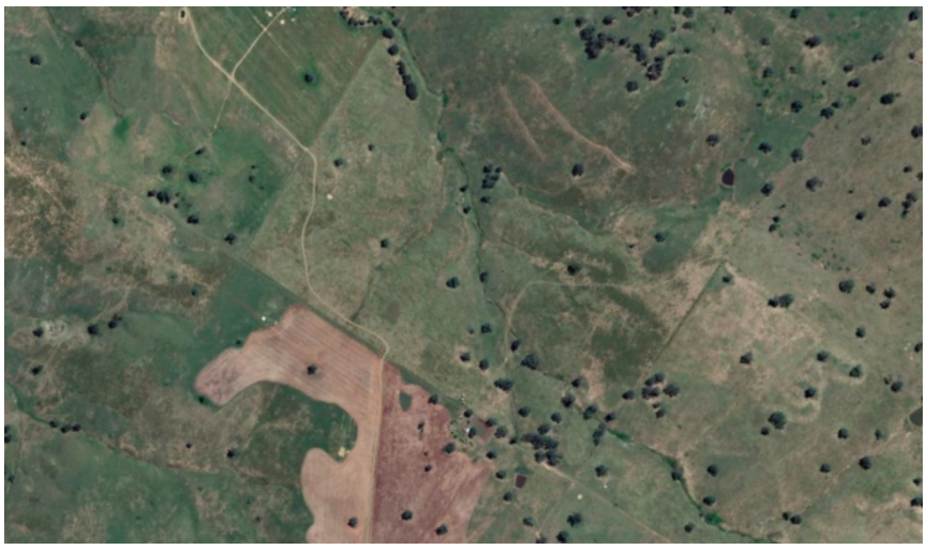
Google Maps 2