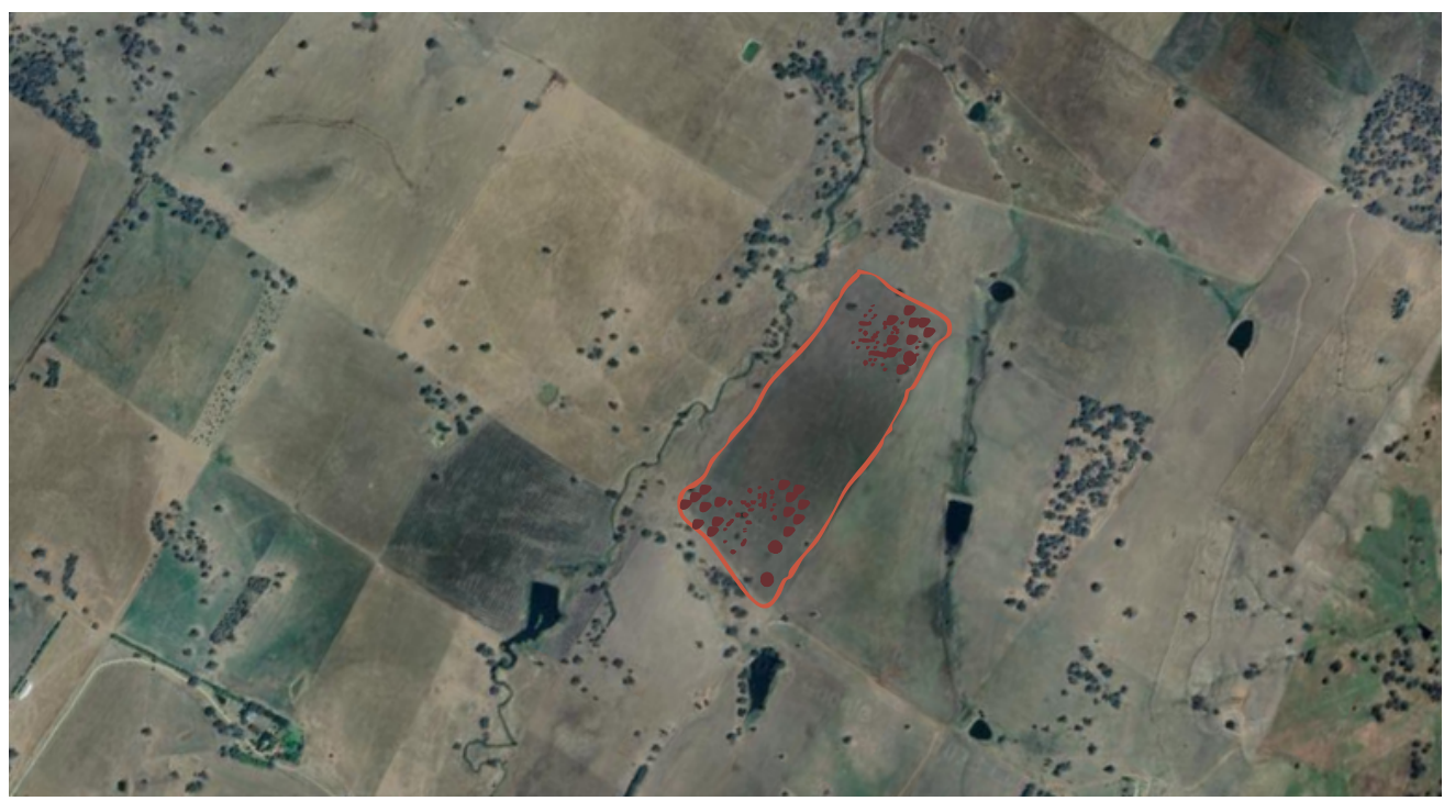
Google Maps 3