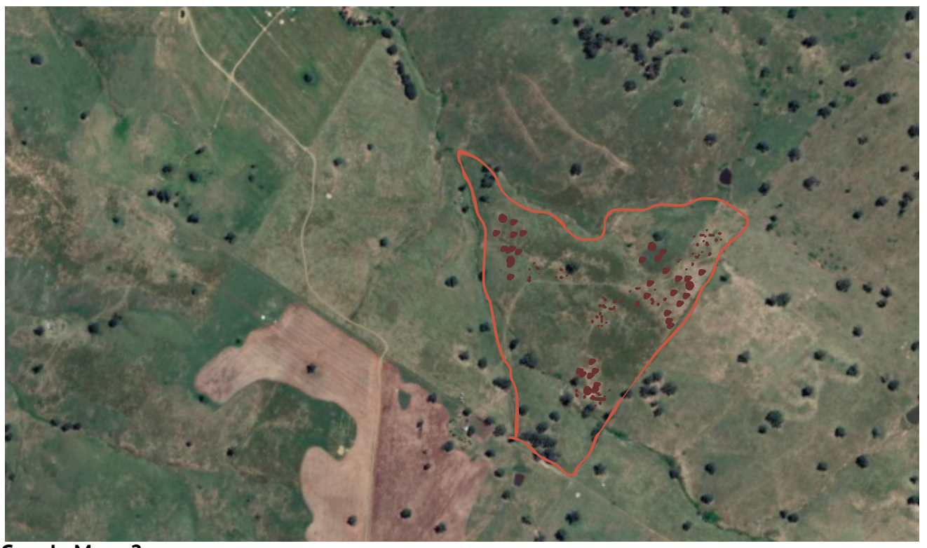
Google Maps 2