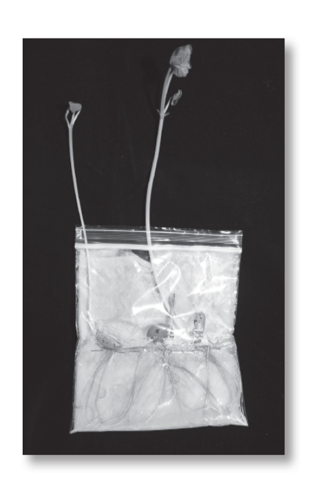
Germinated seeds in re-sealable bag